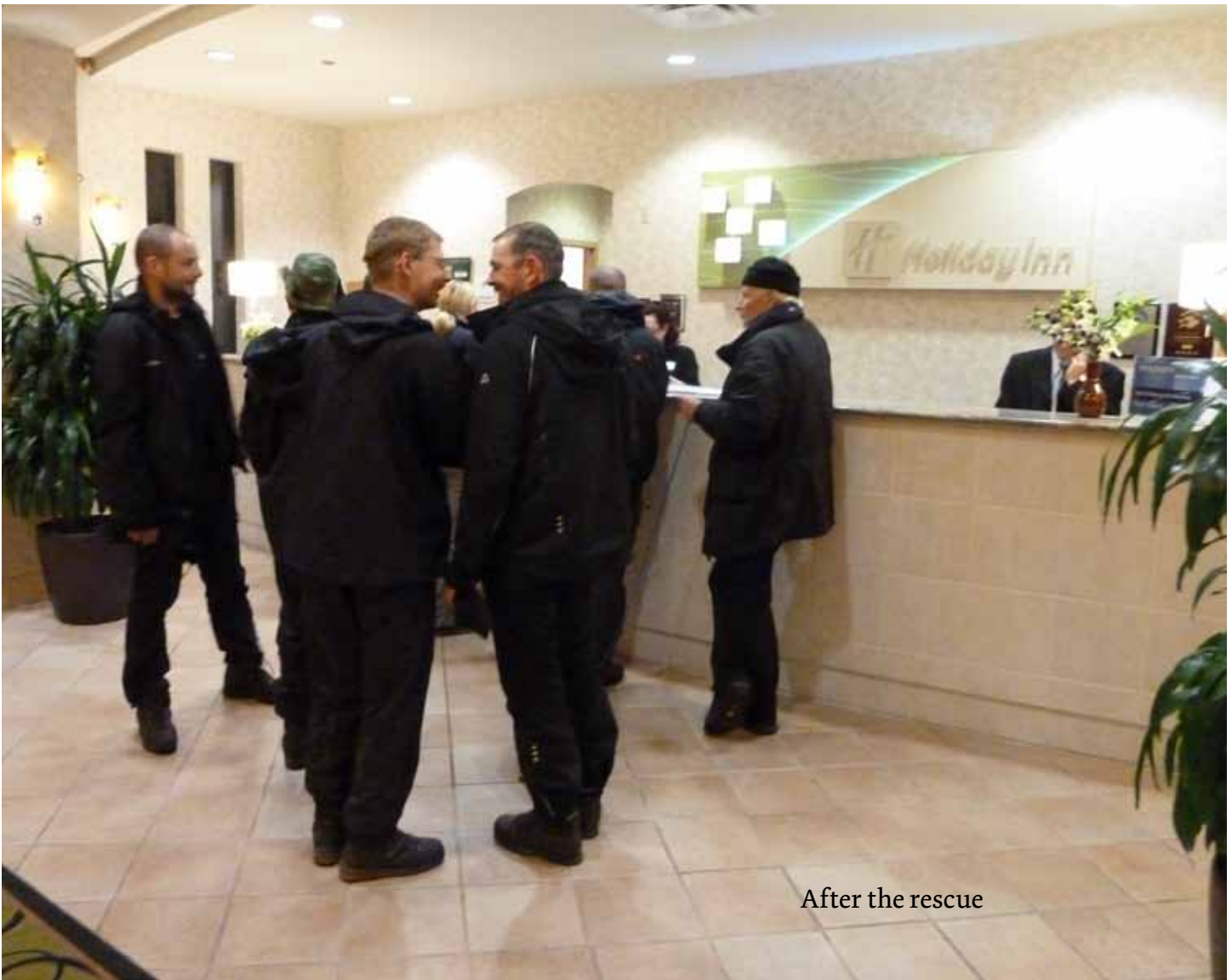
After the rescue