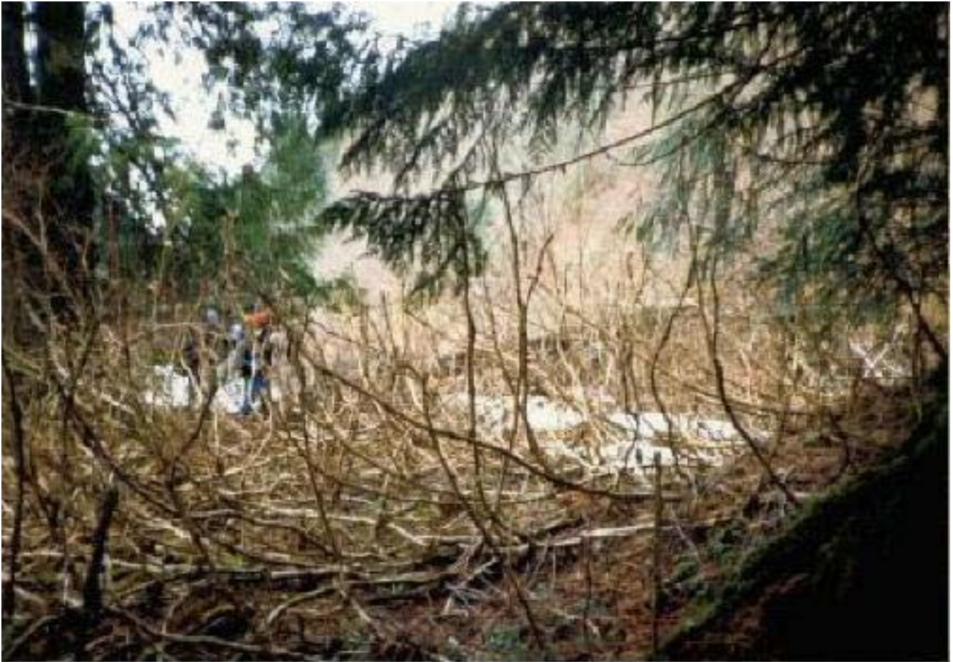
Photograph taken in a small valley near Stave Glacier. The Devils Club in this photo is approximately 10 feet tall and several inches in diameter. It is so large that it dwarves the two men barely visible in the upper left of the photograph.