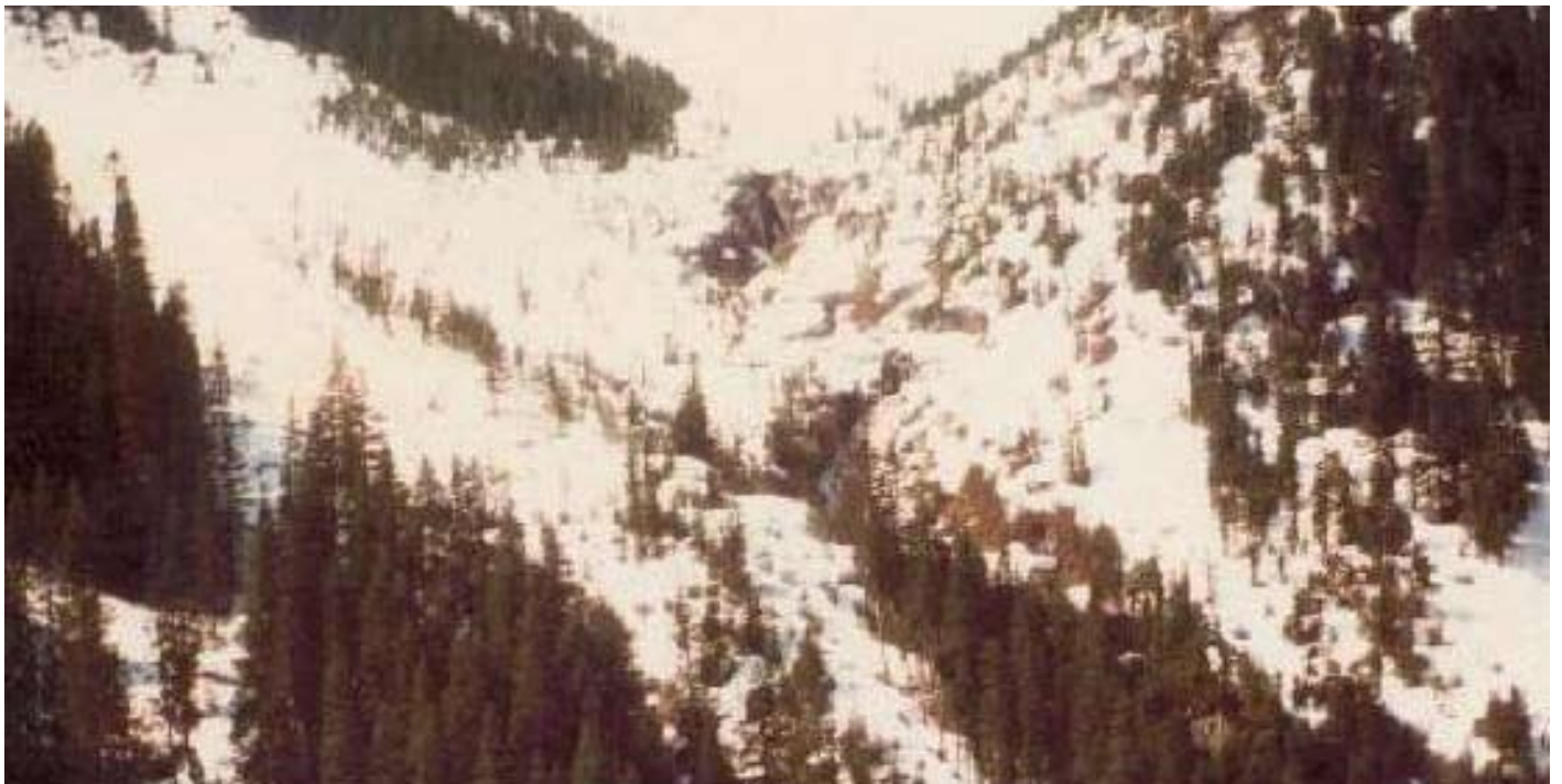
Aerial photograph showing a small creek disappearing and then reappearing several hundred feet away. Numerous creeks in the search area flow intermittently through subterranean channels. Some of the smaller creeks simply disappear underground.