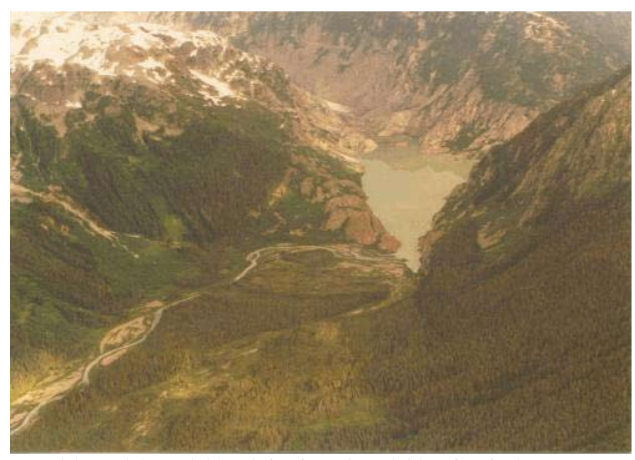
Aerial photograph showing the lake at the foot of Stave Glacier. The lake is often referred to as "Upper Stave Lake." "Doc" Brown's last camp was in this general area.