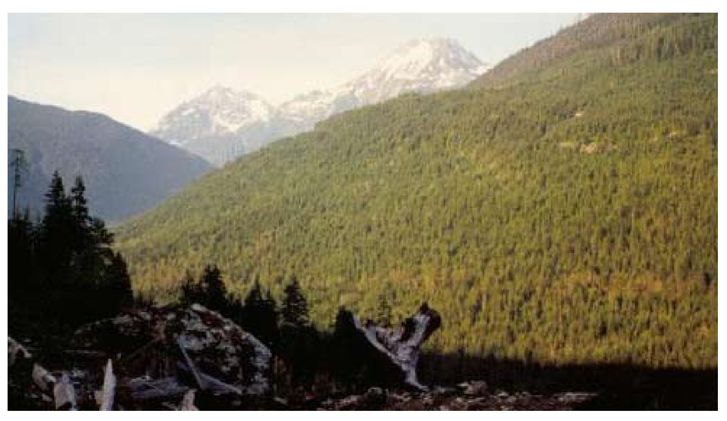
Photograph taken from a logging landing looking towards the headwaters of Corbould Creek and Remote Peak area.