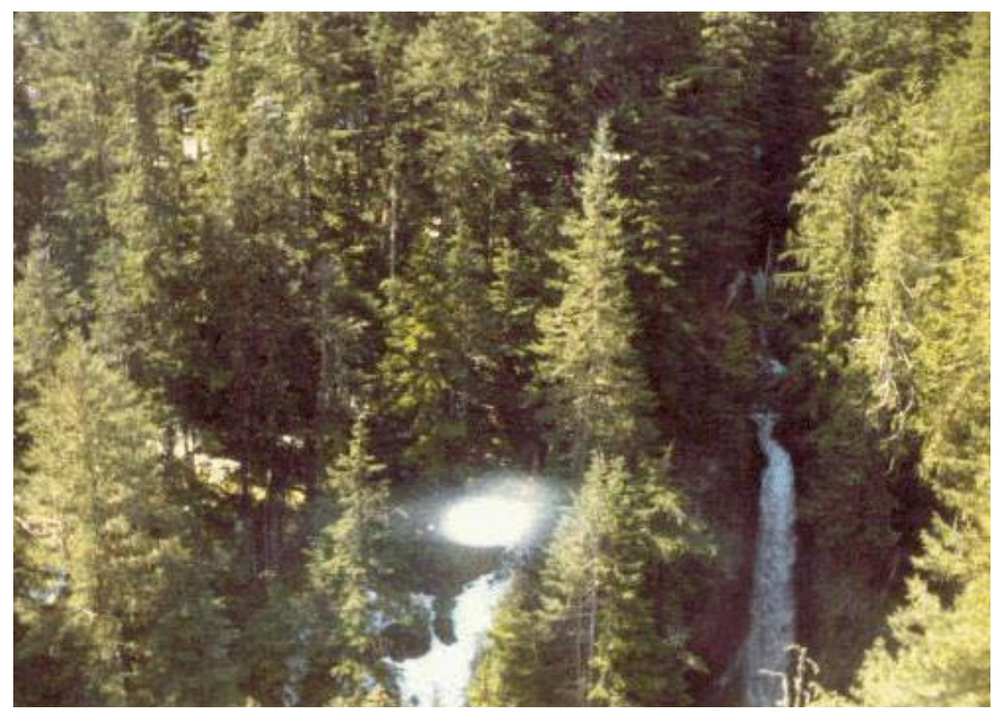
Aerial photograph taken in the general vicinity of where Brown's last camp is believed to have been located. The "spot" in the photo is the reflection of an unidentified object on the ground.